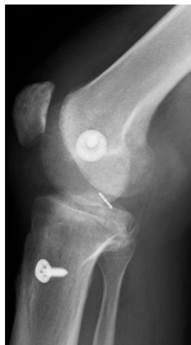
Figure 6: Postoperative lateral radiograph of the right knee demonstrating Endobutton position and the associated posting screw for repair of the PCL fracture avulsion. Also shown is the metalwork related to a medial collateral ligament reattachment.