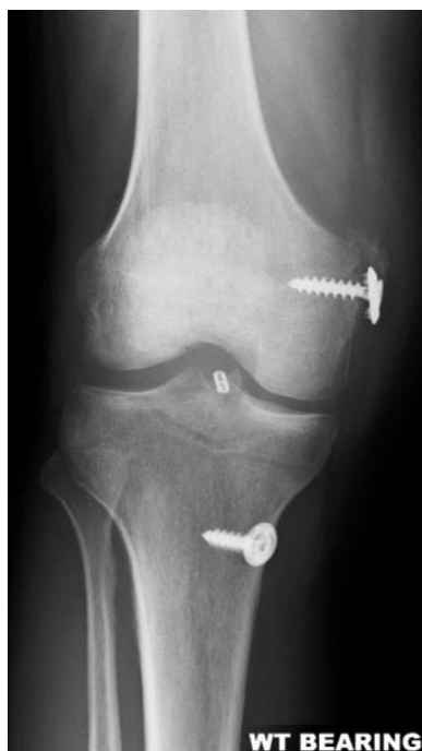
Figure 5: Postoperative anteroposterior radiograph of the right knee demonstrating Endobutton position and the associated posting screw for repair of the PCL fracture avulsion. Also shown is the metalwork related to the medial collateral ligament reattachment.