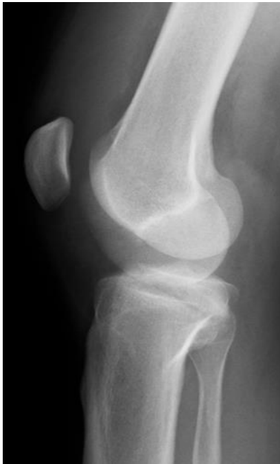
Figure 2: Preoperative lateral radiograph of the right knee demonstrating PCL fracture avulsion.