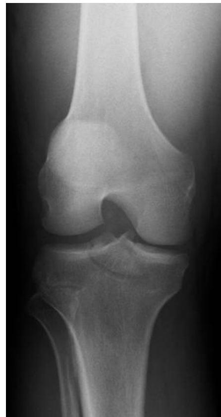
Figure 1: Preoperative anteroposterior radiograph of the right knee demonstrating PCL fracture avulsion.

The PCL avulsion was large fragment with extension to both the medial and lateral tibial plateau. The PCL was